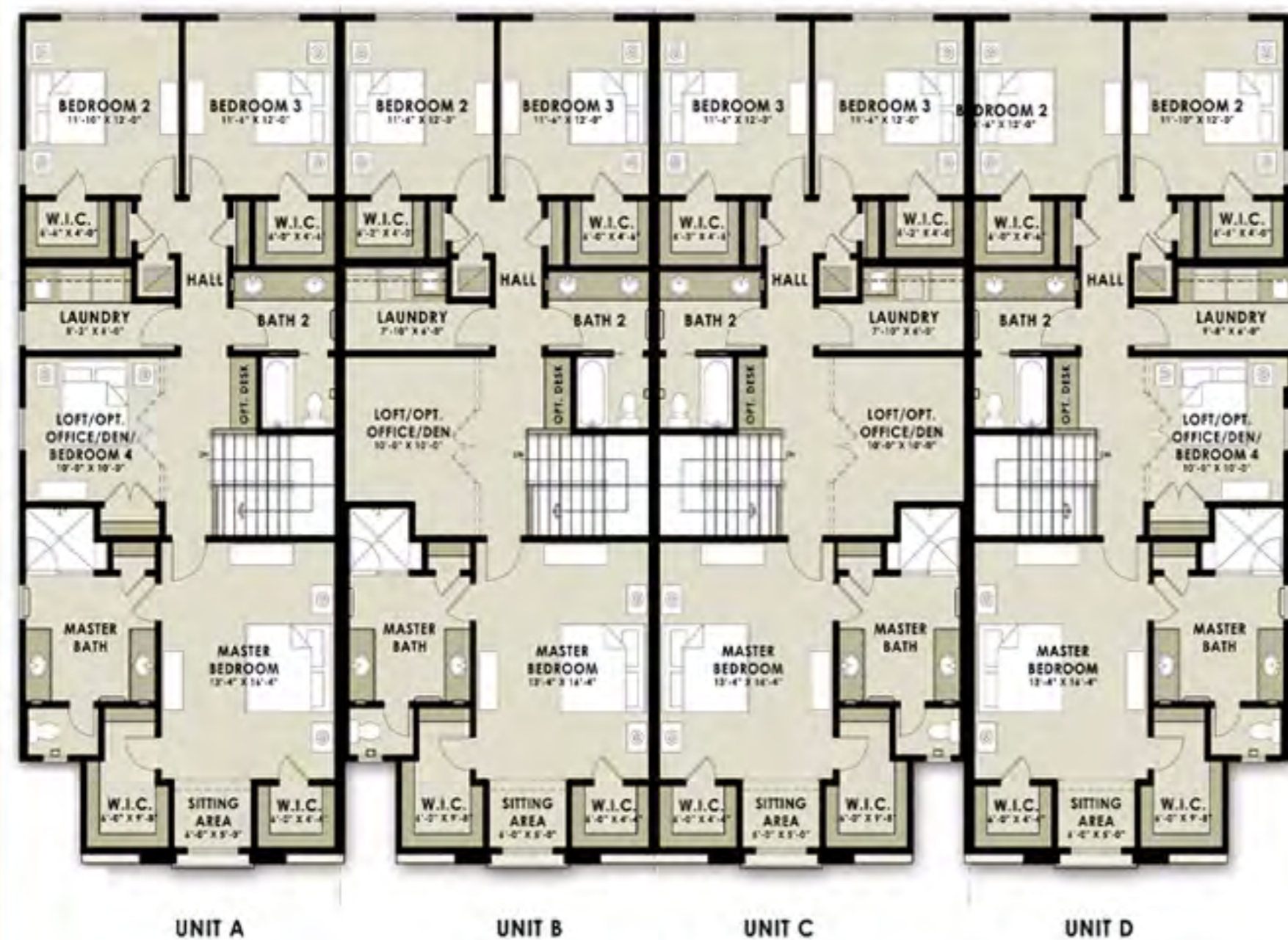
UPPER LEVEL FLOOR PLAN